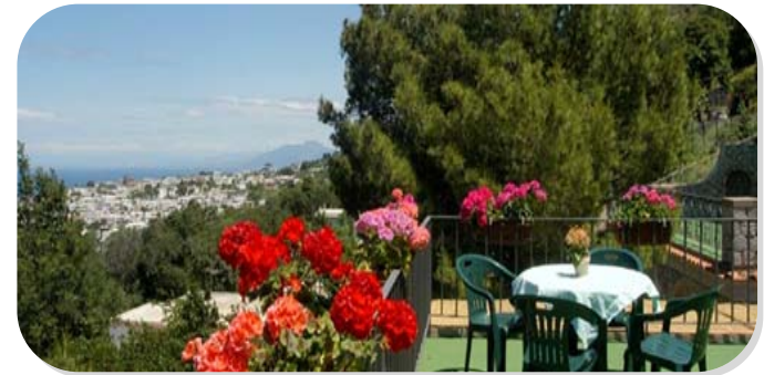
Hotel Alle Ginestre Capri (Italy)

➔ Majority of these hotels are relying on older, less efficient equipment