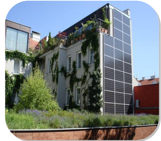
Hotel Boutique Stadthalle (Austria)